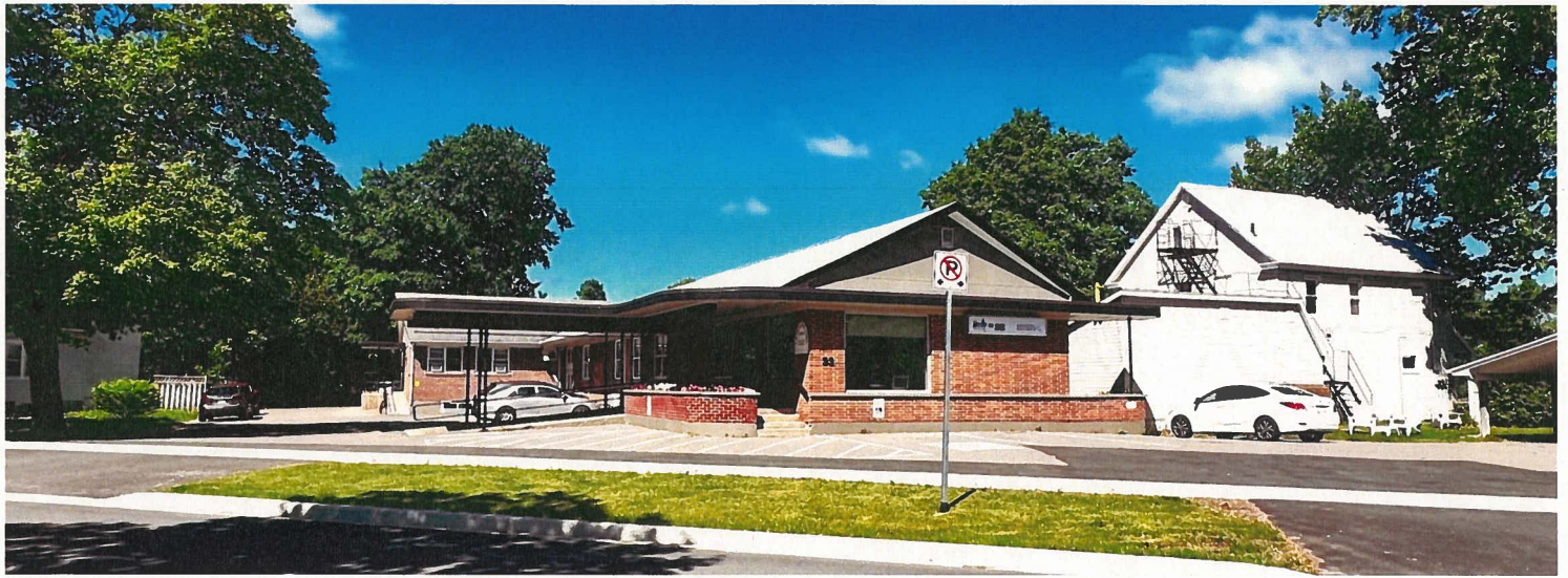
Rookwood Avenue (East) / avenue Rookwood (Est)