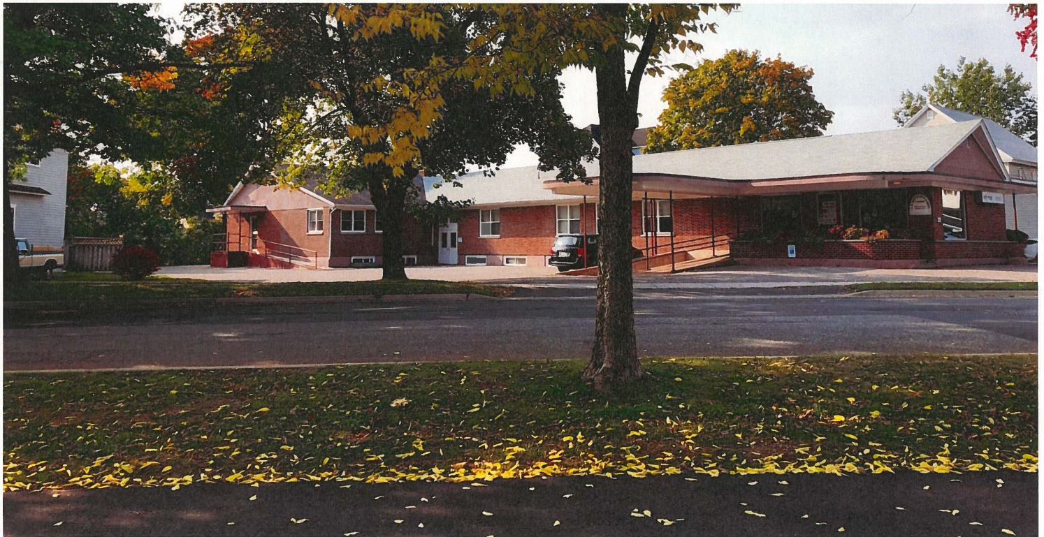
South / Sud